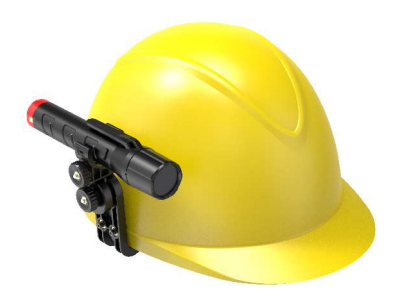
U shape bracket Apply to brimless helmet