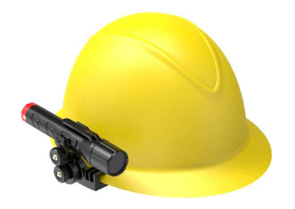
L shape bracket Apply to helmet with brim